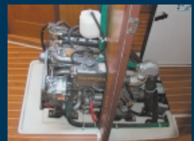
Unrestricted engine access fore and aft