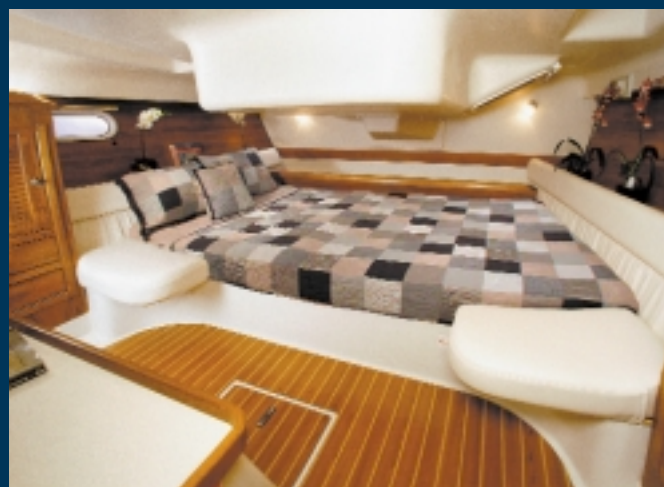
Master cabin aft, with huge athwartship innerspring mattress