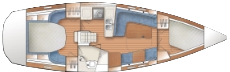
Catalina 387 with centerline master cabin berth