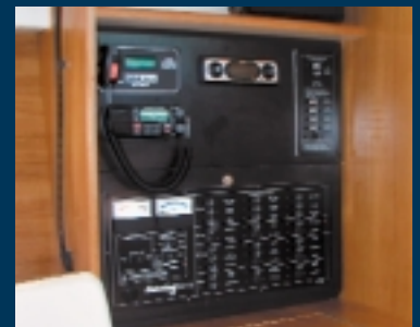
Complete electrical panel with room for expansion