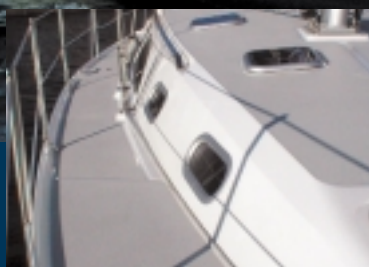
Wide, uncluttered weather decks