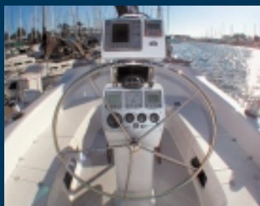
The longest, most comfortable cockpit in 38 feet.