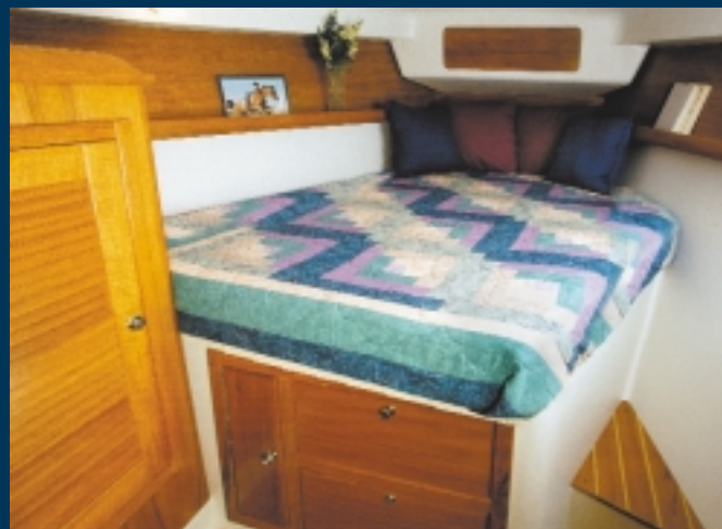
Guest cabin forward, with plenty of natural light and ventilation