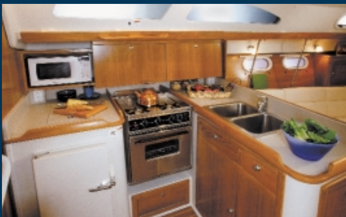
The classic L-shaped galley has been updated to a new level of utility and function, not mention eye appeal.