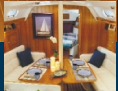
Extended dining table and settee

Not only will a Catalina pay extraordinary dividends in dependable systems and gear, comfortable ocean cruising and seakindly design, but as every Catalina owner will attest, at resale, a Catalina will retain among the highest percentage of original investment. The 387 is every inch a Catalina, she is the collective result of over 35 years of boat building experience and the input from thousands of cruising sailors. And the 387 meets or exceeds the most stringent building certification standards. She is the current high point in the evolution of the modern cruising yacht.