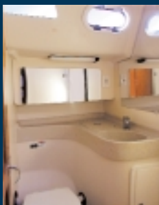
Catalina design quality means a roomy head with three lockers, separate stall shower with it's own bi-fold door .

The well ventilated forward cabin with double berth, thick innerspring mattress, a large hanging locker and plenty of drawer storage offers a comfortable and private retreat for guests. The huge master stateroom, aft, features a huge, full beam, over 8-foot long berth with innerspring mattress, two hanging lockers, cedar lined drawers and large storage bins. The adjacent head compartment features a full stall shower, vanity with sink and three convenient storage lockers. You have a choice of a centerline fore and aft berth or the extra long athwartship berth.