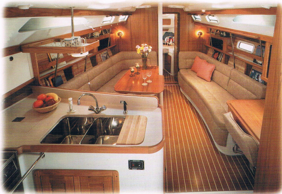
The beautifully appointed salon is finished in varnished teak and ash, complimented with your choice of available upholstery fabrics

T he New Catalina 380 is designed to incorporate the performance, accommodations and features experienced sailors told us are important in their next boat. The ability to listen to boat owners is our most important design tool. All aspects of the 380 from the securely stayed rig, to the choice of deep or shoal draft keels, reflect your sailing lifestyle.